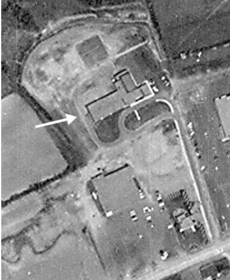
Aerial View of Arlington Heights Elementary School

2001 Stroudsburg, PA-NJ Quadrangle . Topography compiled 1999. Planimetry derived from imagery taken 1999 and other sources. Survey control current as of 1955. Boundaries current as of 2001. Denver, CO.